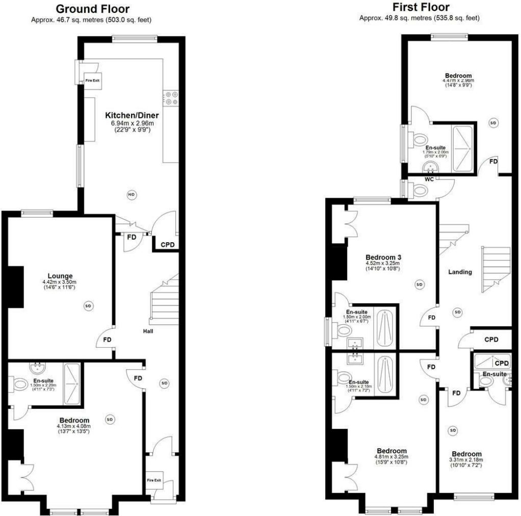
Total area: approx. 96.5 sq. metres (1038.8 sq. feet) 104 Sidney Grove